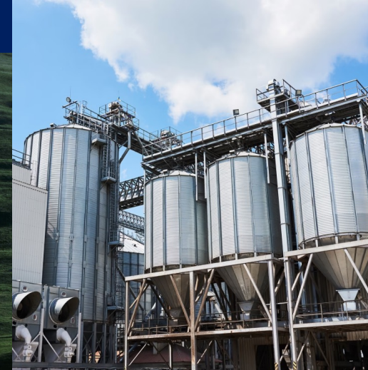
Green Energy Production