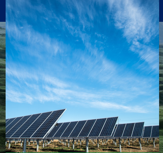
Renewable Energy Services